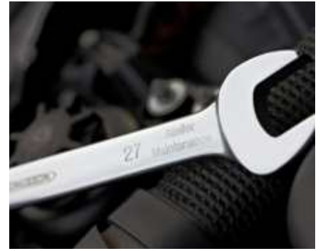
Marking tools for identification and equipment traceability