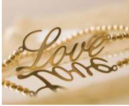
Cutting & engraving