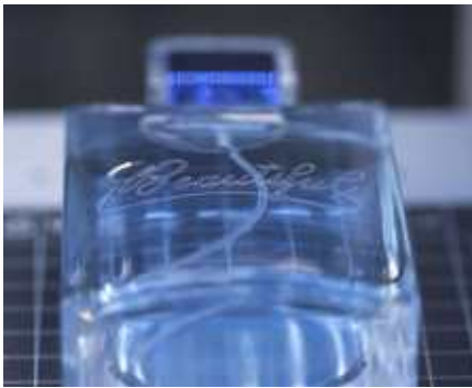
Cosmetics & luxury