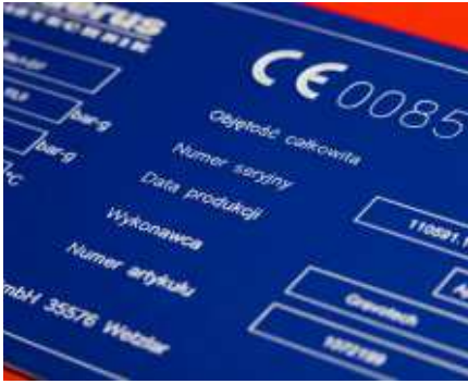
Traceability of industrial parts