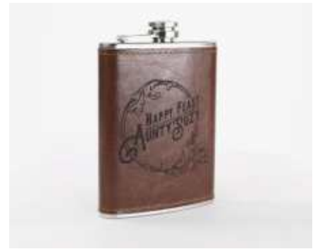
Gifts & personalization