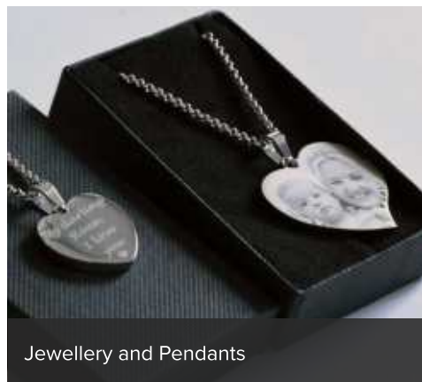
Jewellery and Pendants